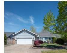
6011 Pine Ridge $394,000 SOLD