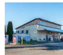
Alvadore Store Alvadore $470,000 SOLD