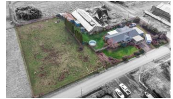
273910 8 th St, Alvadore $430,000 SOLD

Cheryl Chambers Hybrid Real Estate 541-689-4621