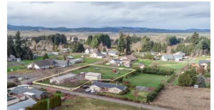
90869 B St, Alvadore $350.00 SOLD