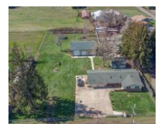
90812 Alvadore Rd Alvadore $530,000 SOLD