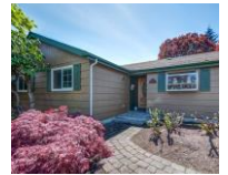
211 Woodlane, $365,000 PENDING