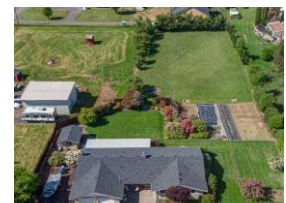
90828 8 th St, Alvadore $525,000 PENDING