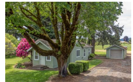
90798 Alvadore Rd House Only List Price $295,000 PENDING