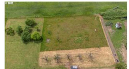
90798 Alvadore Rd Lot Only .44 Acre List Price $140,000 PENDING