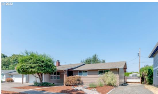
2145 Carmel, Eugene OR 97401 FOR SALE $425,000 3 bed 1.5 Bath with 2 nd full bath ready to finish