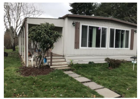
27645 Snyder Rd #1 Junction City SOLD PRICE $40,000