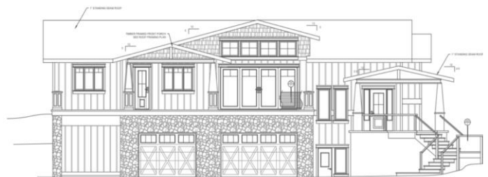
4899 Elva Lane, Eugene 97405 .64 Lot w/ Approved Building Plans FOR SALE $250,000

Or Option to Have Home Built FOR SALE $1,200,000 - $1,300,000