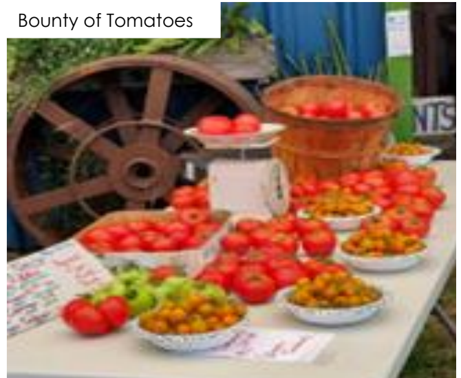
Bounty of Tomatoes