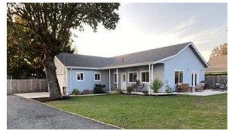
94399 Oaklea, Junction City Sold $589,900