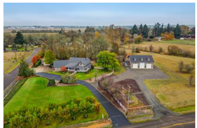
28244 Edgewater Dr, Eugene Or 3.12 Acres in Clear Lake Estates