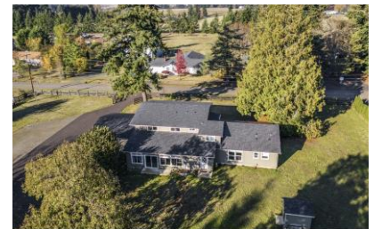
35644 Zephyr, Pleasant Hill Sold $950,000