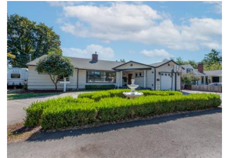
366 Knoop, Eugene Sold $485,000