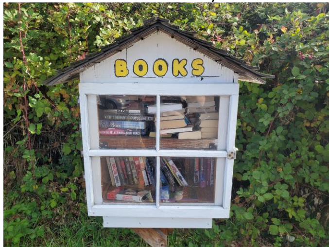
Behind the Fire Station 90829 Alvadore Road

Thanks to Local Neighbors, you can stop by Alvadore's Little Free Library and grab some great reads any time of the day.